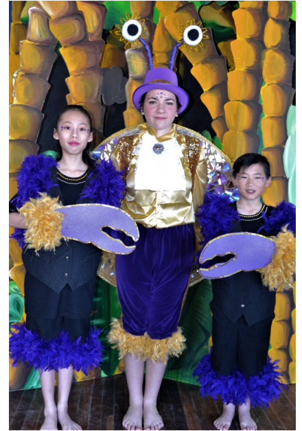
Tamatoa & Claws