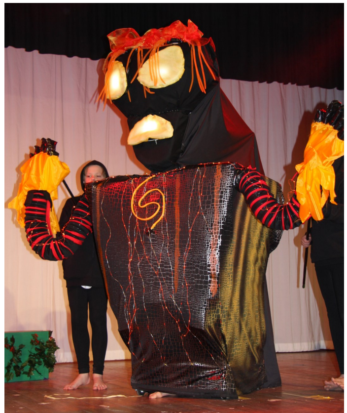
Te Ka - puppet on wheels with multiple lighting features