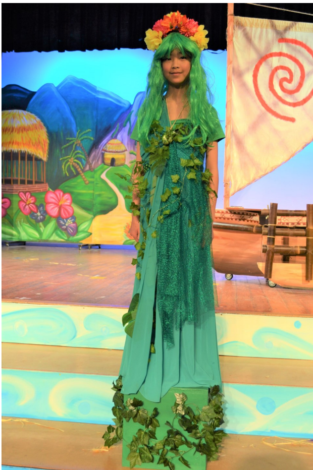
Te Fiti + box to stand on