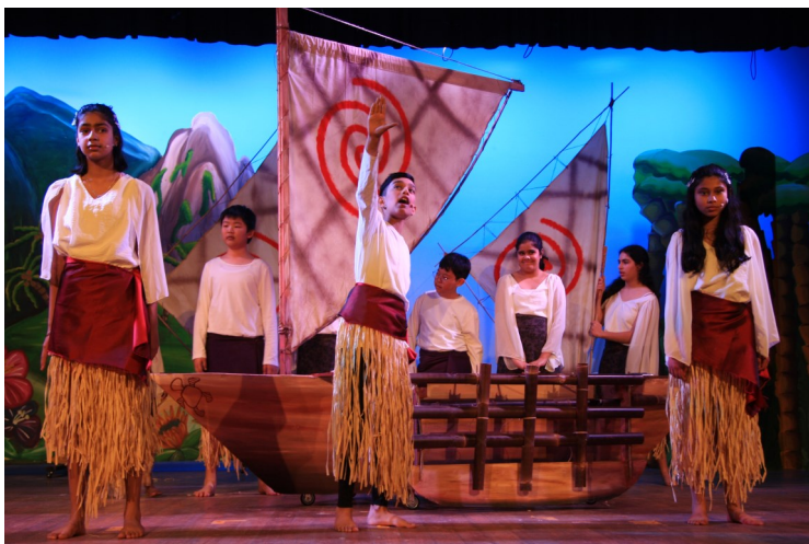
Chief Ancestors (they also have a shell necklace)