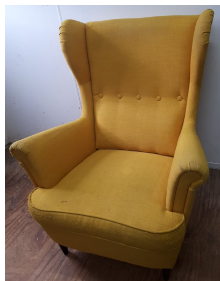
Wormwood House Chair